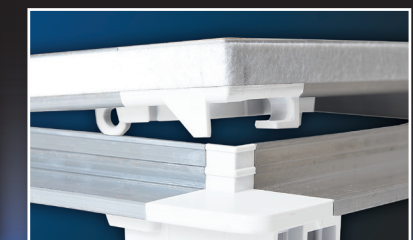
Felt gasket surrounds perimeter of door to help prevent air & temperature control