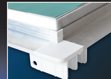
Heavy duty reinforced plastic corners ensures flush installation