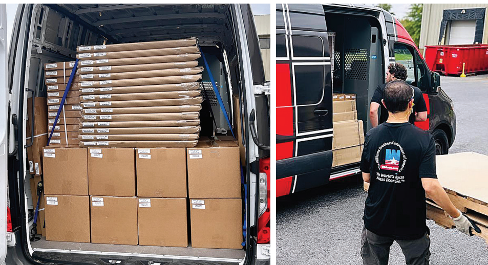
Fully loaded delivery van ready to go out to our customers.

As the leaves begin to fall, so do delivery times! The Williams Brothers Corporation of America is proud to showcase our state-of-the-art fleet of delivery vans, ensuring that your access doors arrive FAST and SAFE. Our vibrant vans are hard at work, delivering from Virginia all the way to Massachusetts. Each vehicle is equipped to handle even the toughest conditions, ensuring that your projects stay on track, wherever you are. From city streets to construction sites, we've got your access doors covered!