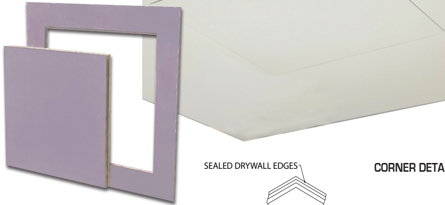
SEALED DRYWALL EDGES CORNER DETAIL